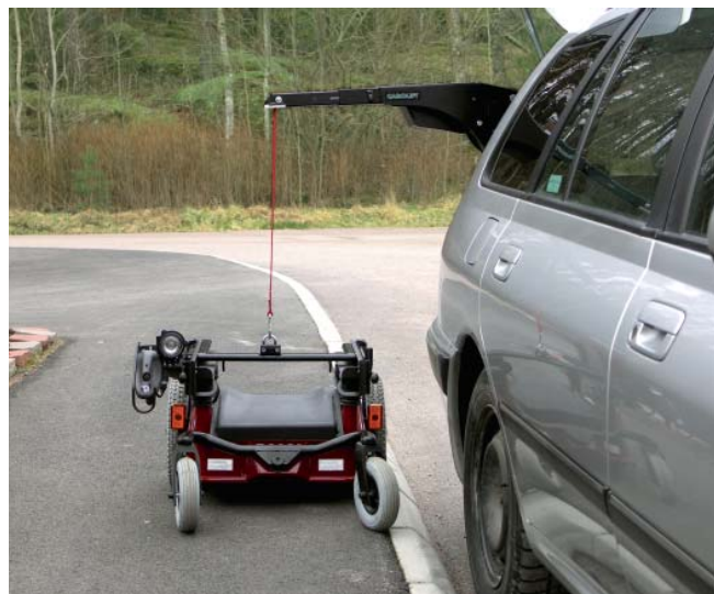
Carolift 6000 picks up a Carony Go wheel unit from the pavement.

The hoist arm of Carolift 6000/6900 has an off-set design (like two "elbows") which enables loading from the side of the vehicle. This means you can keep the wheelchair placed on the pavement thus not needing to descend to street level.