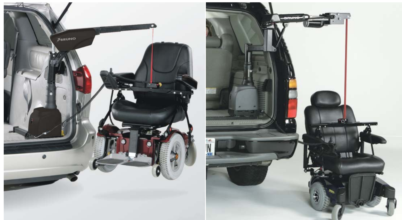
The Carolift 6000 has a lift capacity of 181 kg.

The Carolift model 6900 has a telescoping hoist head to pass through narrow door openings or to bypass wide bumpers.