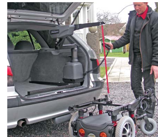
The Carolift 6000 is loading a Carony Go wheel unit in a Peugeot 406 with a sloping rear door design.