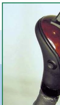
Wood/black handle and cover around the lever bar.