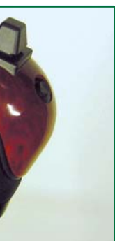
...dle and grey lever bar.