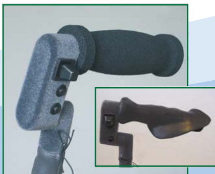
T-grip with a soft cylinder shaped design and T-grip in a modelled design with solid surface.

Hill holder and set function for cruise are standard. Carospeed Indicator is available with a black coloured handle and a grey cover for the lever bar.