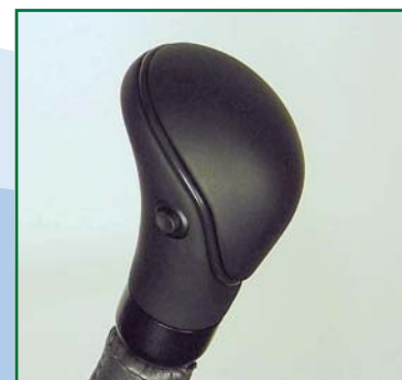
Black handle and grey cover around the lever bar.