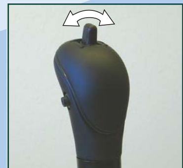
Carospeed Indicator is only available with a black handle.

Carospeed Indicator has a switch only for the turn left and the turn right indicator.